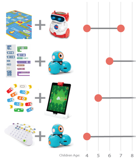
Figure 2. Environments used in Study 1. From top to bottom: robot DOC and map; robot DASH and BLOCKLY App; Osmo Coding AWBIE App and blocks; and robot DASH, PUZZLETS blocks and tray.

Robots are attractive and engaging for children, and relevant to learn complex concepts [4, 8, 44] such as CT. The educators highlighted the importance of using a robot and its physical and socio-emotional features. All educators preferred DASH