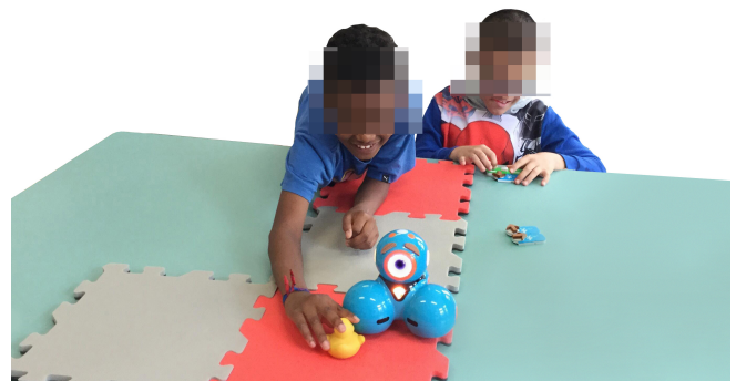
Figure 1. Two visually impaired children performing a goal-directed spatial programming activity in Study 2.

career development [52]. Promoting CT has been increasingly performed with programming activities. The advent of visual programming environments, like Scratch [40] or Blockly [16], democratized programming in schools. These allow children to create highly visual applications by composing virtual blocks. The use of tangible blocks has also been used as a way to facilitate understanding of abstract concepts, reduce cognitive load, and promote CT, while simultaneously developing motor, perceptual and cognitive abilities [19]. Programming a robot, with these environments (virtual or tangible), is another trend that increases the physicality of the programming output, and provides a greater sense of control [44].